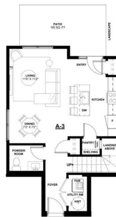
Main Floor 604 ft²