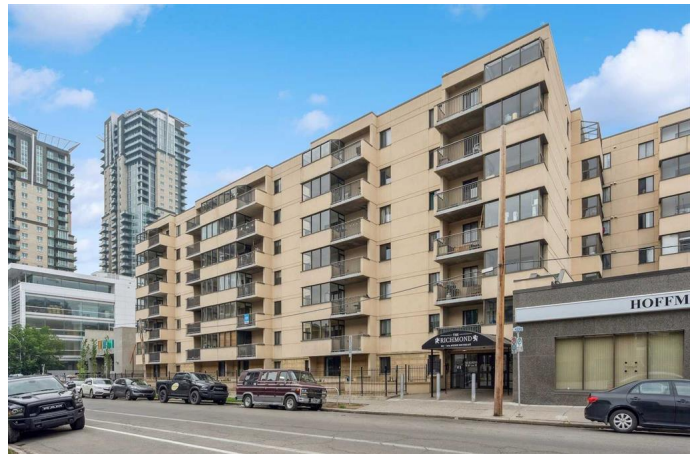
214 111 14 AVE SE - 06.12.2025 Main - 823.17 sq.ft / 76.47 m 2 RMS Area - 823.17 sq.ft / 76.47 m 2